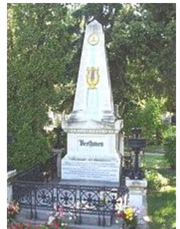
Beethoven's Vienna grave site